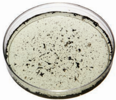
Extracted humic product in Liquid Fertilizer

Both mixtures were agitated for two minutes.