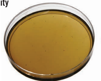
ENERSOL in Liquid Fertilizer

Unlike extracted humic products, ENERSOL is compatible with liquid fertilizer.