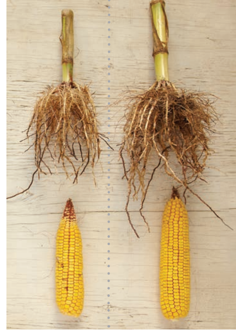
ENERSOL treated corn have a larger root system, increased crop yields and larger, bigger leaves.