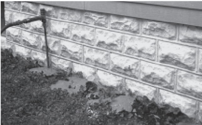
EXTERIOR MASONRY WALL APPLICATION: Inject BENTOGROUT along the exterior of a foundation wall at 24" (600 mm) on center intervals.