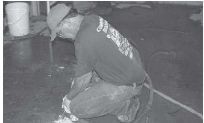
STRUCTURAL SLAB APPLICATION: Inject BENTOGROUT under an existing slab to provide waterproofing and fill void areas.