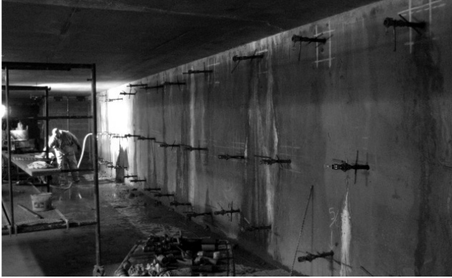
INTERIOR SURFACE GROUT INJECTION: BENTOGROUT is applied to the inside of the building without excavating the site.