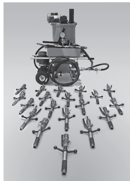
CETCO BENTOGROUT Pump, Mixer and Accessories.

Caution: Pumping any material under pressure can cause lifting or movement of adjacent structures.