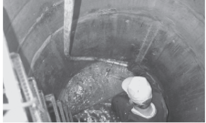
INTERIOR THROUGH WALL APPLICATION: BENTOGROUT injected to the exterior of a manhole through pre-drilled holes using a short injection wand.